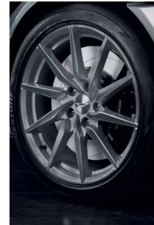
Winter Wheel and Tyre Kit