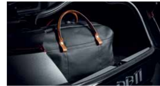
4-Piece Luggage Set